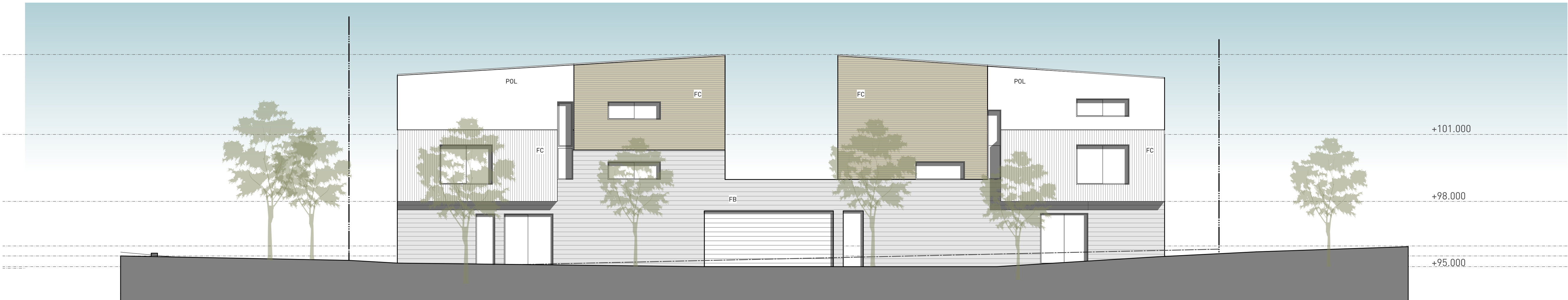
3 SOUTH-EAST ELEVATION 1:100

REFER TO SELECTIONS SCHEDULE FOR MORE DETAIL