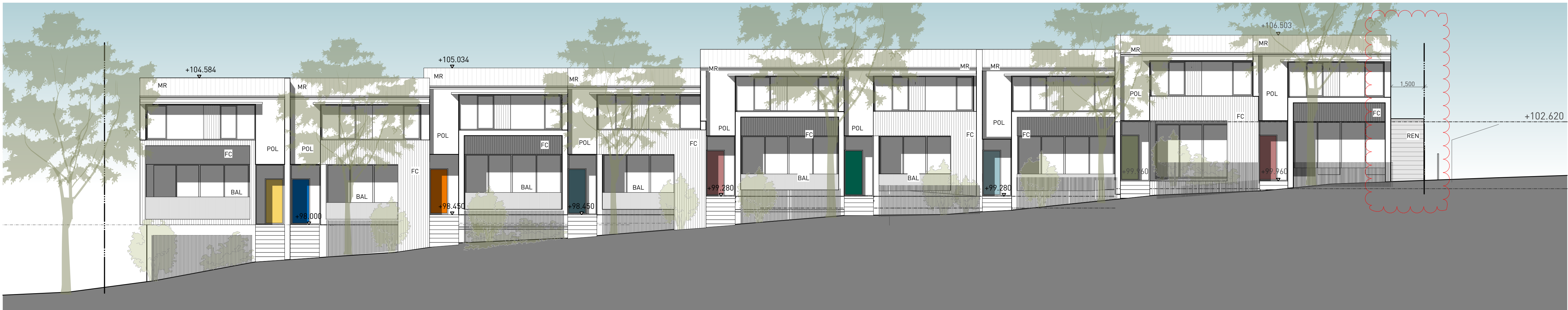
1 NORTH-EAST ELEVATION 1:100